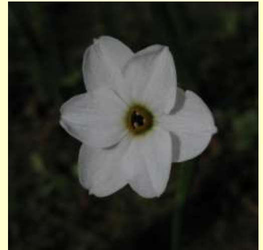
N. miniatus SFR