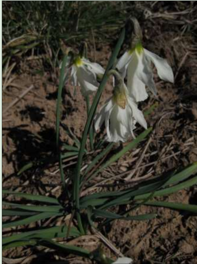
N. alpestris ( N. moschatus )