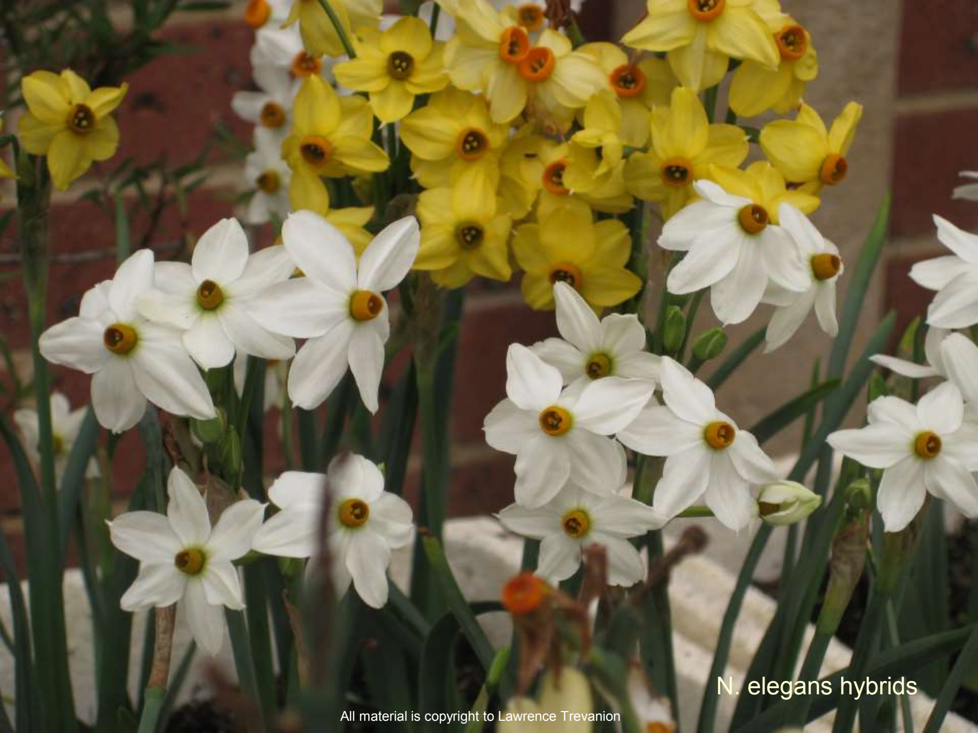
N. elegans hybrids