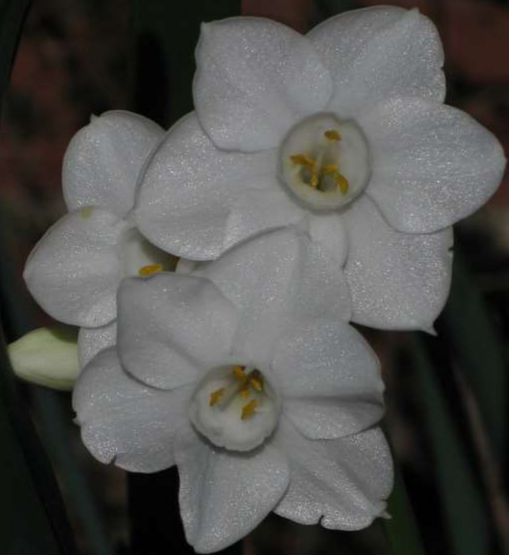
Paperwhite N. broussonetii hybrid