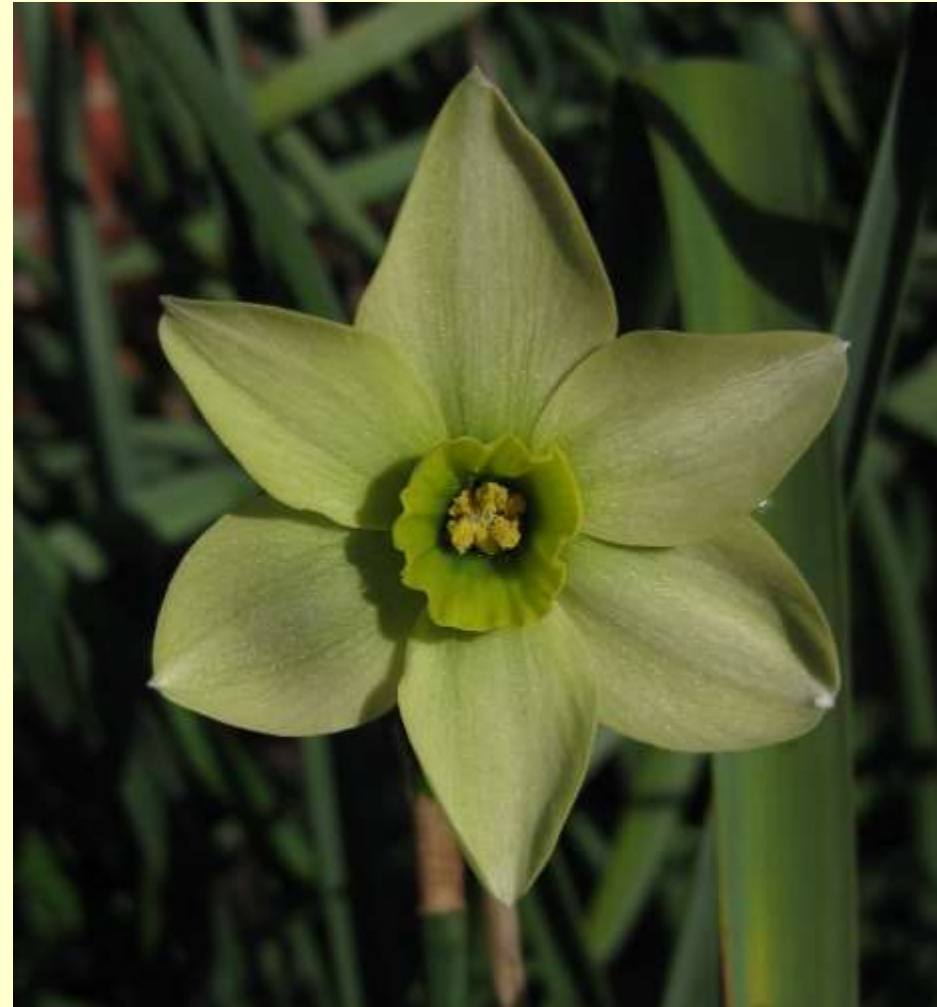
13_05MJ Viriton x Virivest